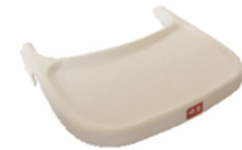
2、 Removable food tray